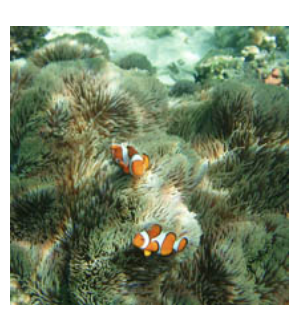
280,000 square kilometers beneath <u>the ocean</u>