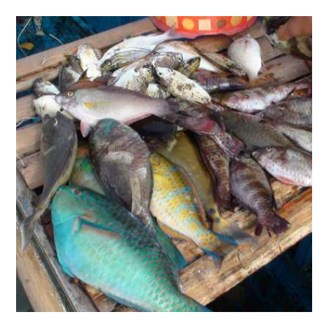
<u>Project: Slow Food Campaign - Un-</u> <u>derstanding the Oceans</u>