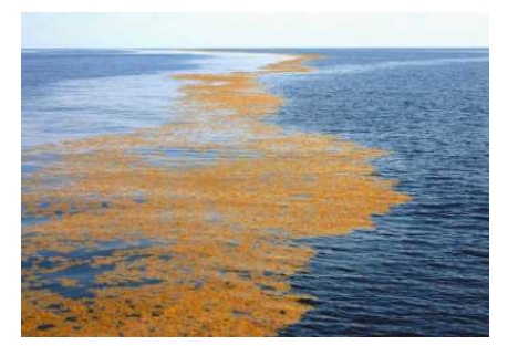
Free-floating Sargassum offers protection and habitat for many species.