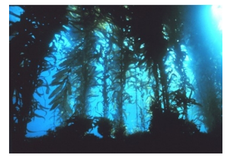
Brown algae like the giant bladder kelp (Macrocystis pyrifera) can reach the colossal length of 100 metres. The long fronds grow by up to 60 centimetres a day.