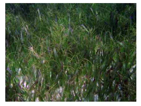
Light sea grass meadows in the shallow waters of the Florida Keys.