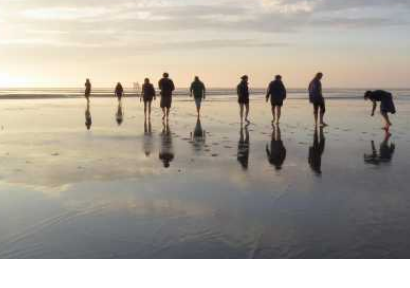
<u>Project: Beachexplorer - what you</u> <u>can find on the beach</u>