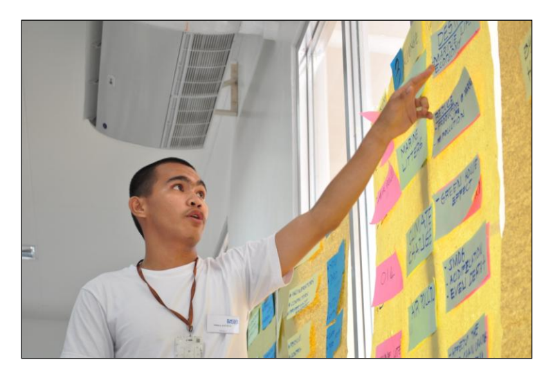
Above: A presenter of the 3^{\rm rd} Group emphasizing a case in point based on what they discussed during the breakout sessions.