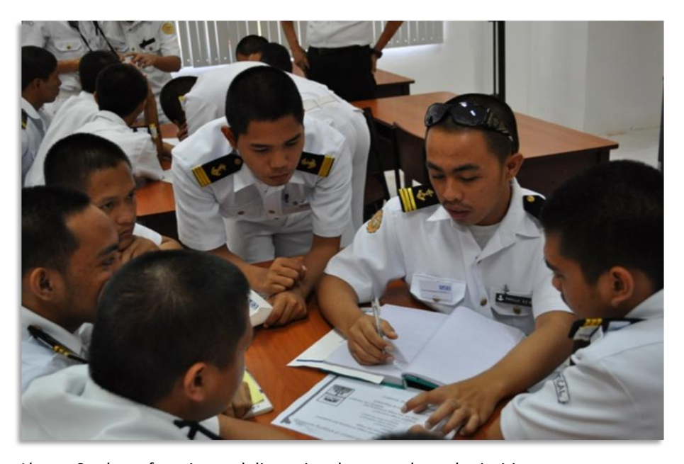
Above: Students focusing and discussing the re-evaluated priorities.