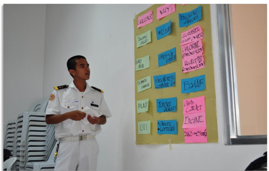
Above: A students suggesting ways and means to deal with the top two challenges listed on their presentations.

After some deliberations among the faculty present, the 3<sup>rd</sup> group was adjudged as the best among the presentations because of the way they explained how seafarers can be part of the solution to problems and challenges in marine pollution.