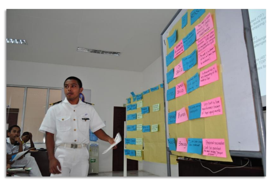
Above: A student explaining the change in priorities. He attributed the new rankings to new information absorbed from the succeeding lectures.